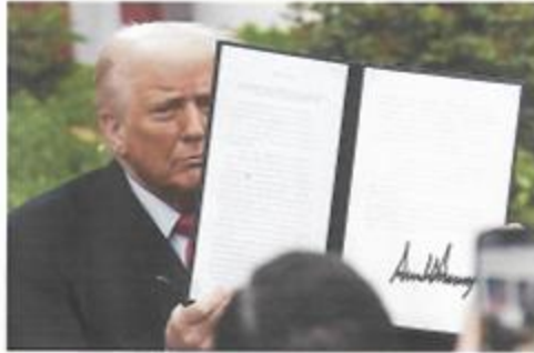
President Donald Trump holds a signed executive order announcing new tariffs during an event April 2 in the White House Rose Garden.