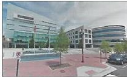
George Mason University, Arlington Campus.